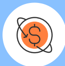
Cash Forecasting & Reporting